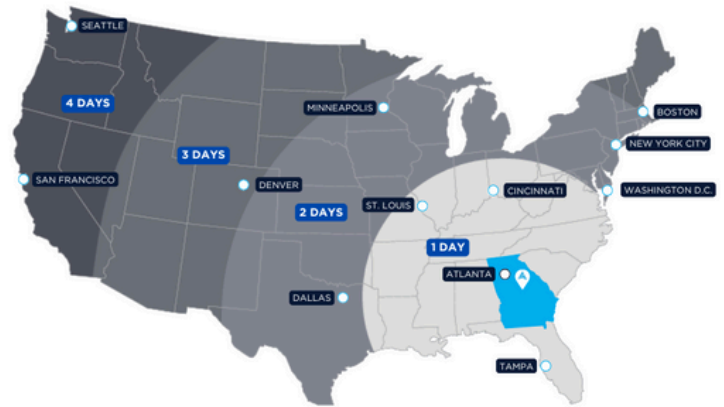
AIR TRANSIT TIMES FROM GEORGIA