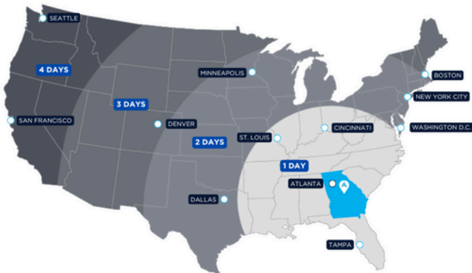
TRUCK TRANSIT TIMES FROM GEORGIA

This property's strategic location, just 2.5 hours from the Port of Savannah, provides easy access to one of the nation's most efficient deep-water ports. As the fourth-busiest port in the US and a key gateway to Asia, the Port of Savannah's ongoing investments in infrastructure, such as the dredging project, solidify its position as a leading global port.