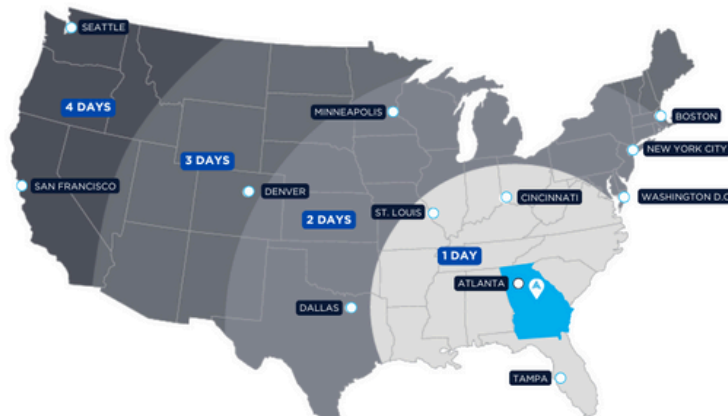
RAIL TRANSIT TIMES FROM GEORGIA